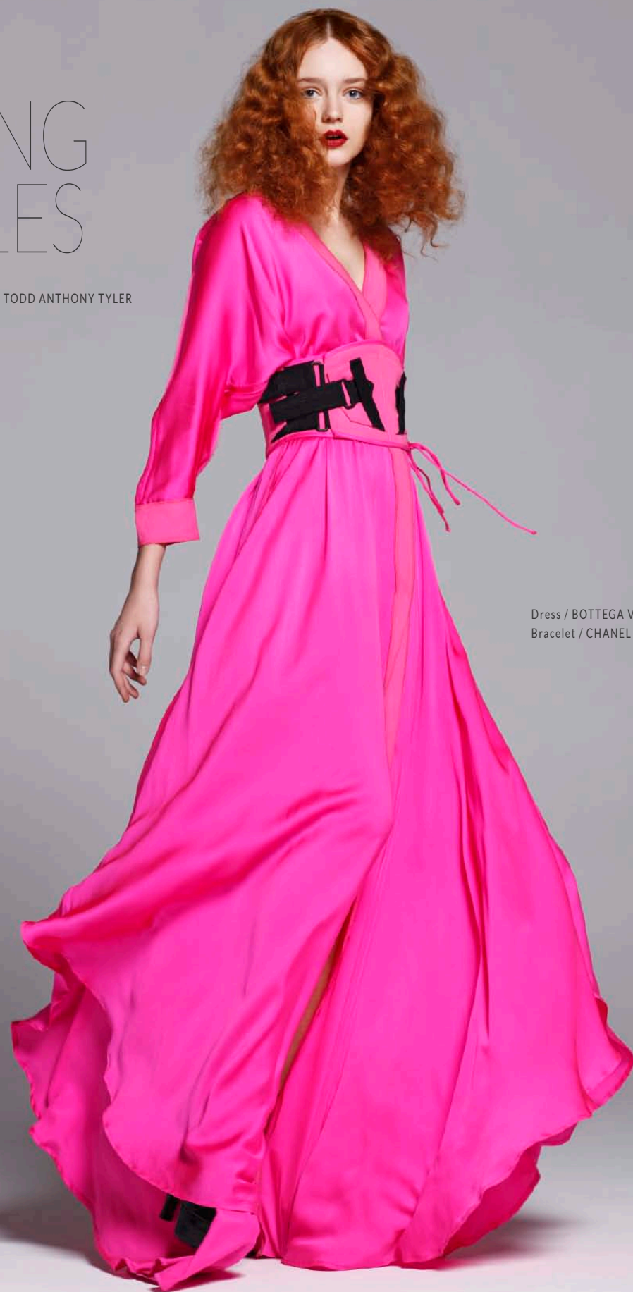
Dress / BOTTEGA VENETA Bracelet / CHANEL