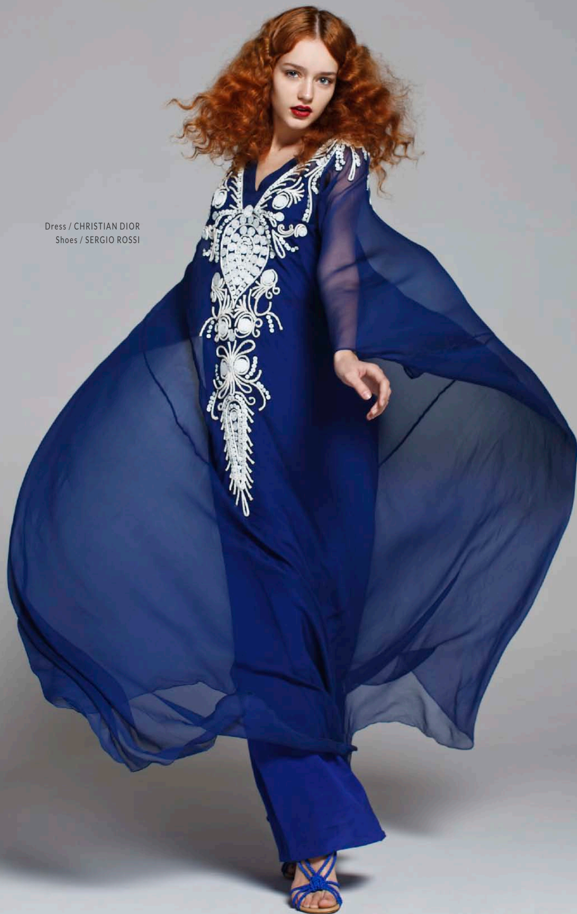
Dress / CHRISTIAN DIOR Shoes / SERGIO ROSSI