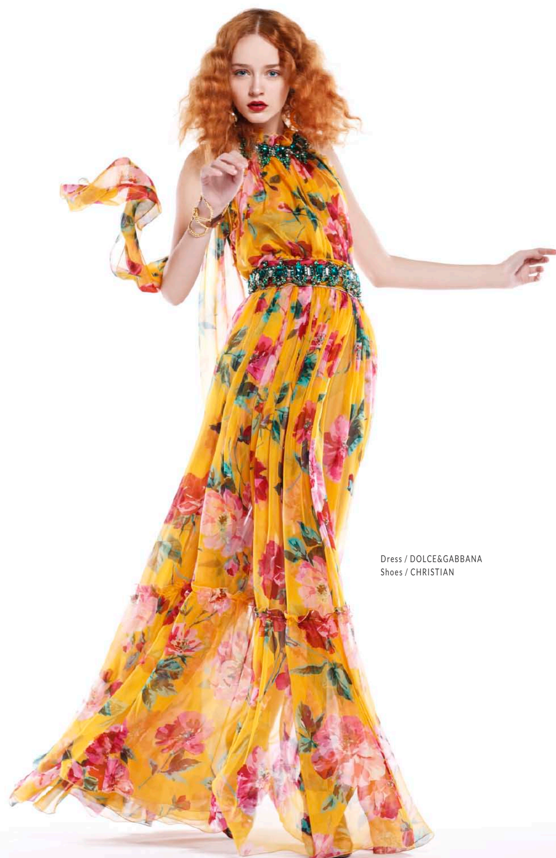
Dress / DOLCE&GABBANA Shoes / CHRISTIAN