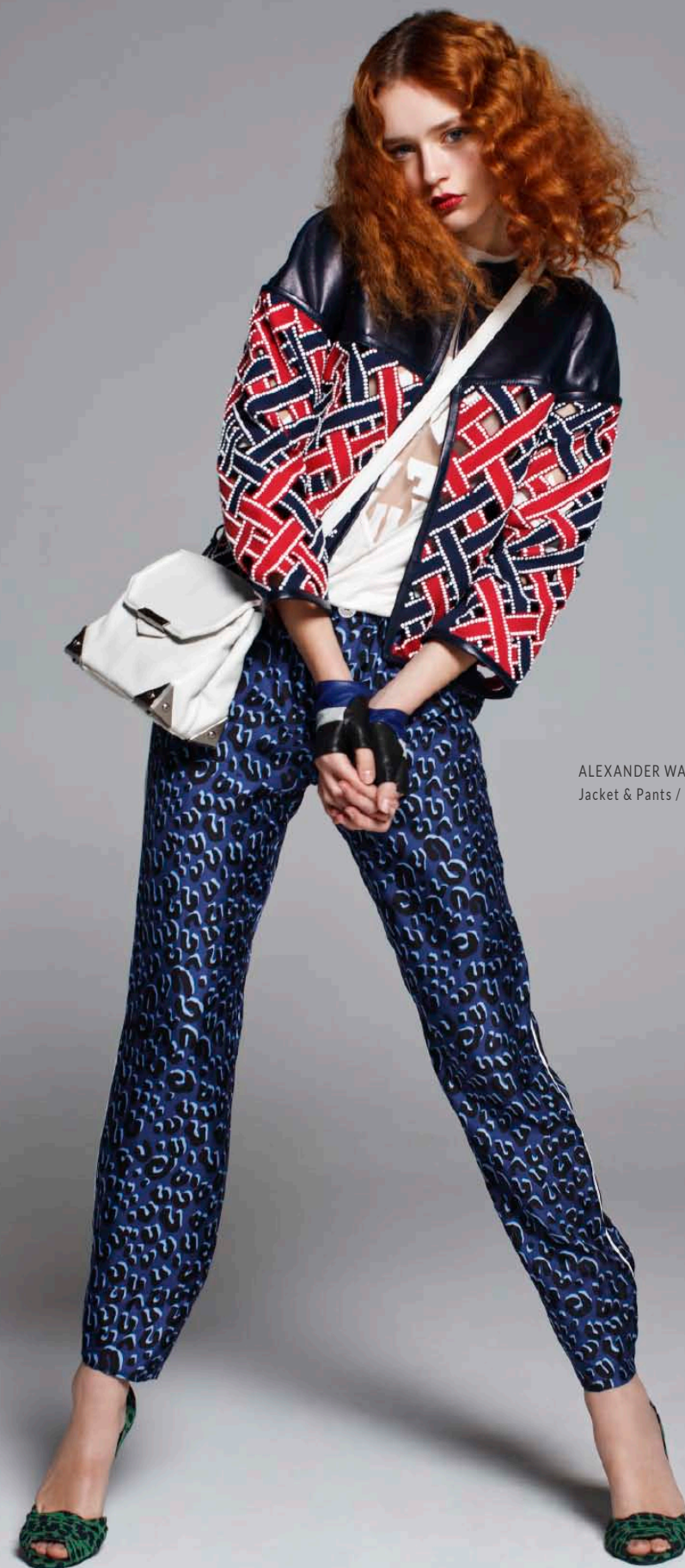
ALEXANDER WANG Jacket & Pants / LV