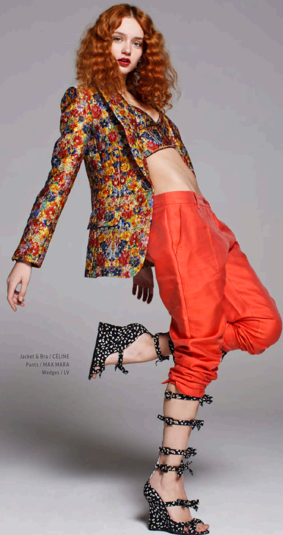
Jacket & Bra / CÉLINE Pants / MAX MARA Wedges / LV