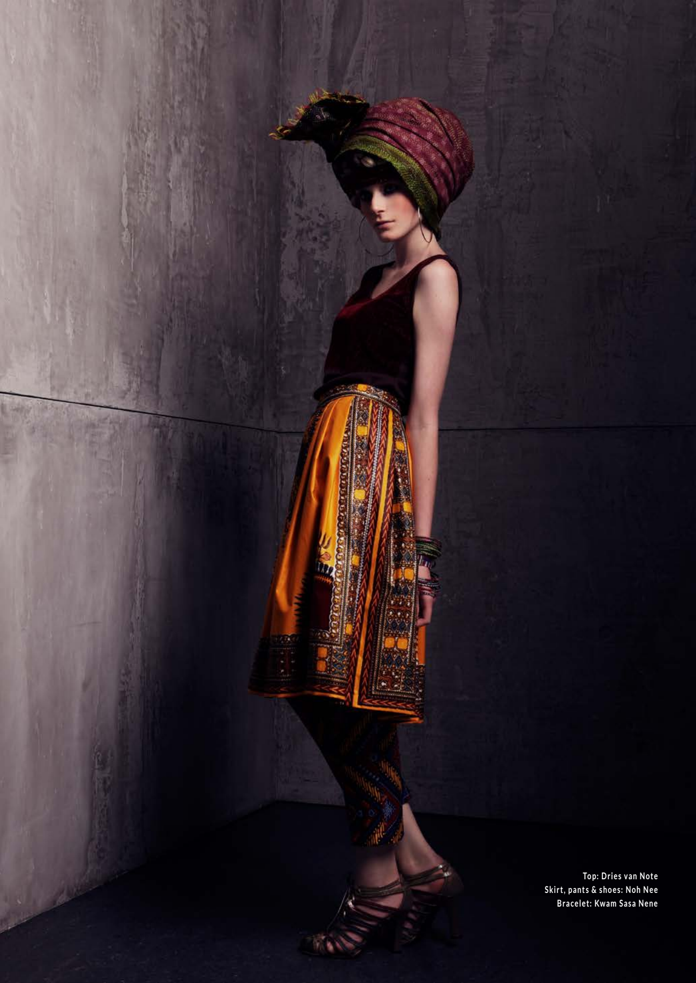
Top: Dries van Note Skirt, pants & shoes: Noh Nee Bracelet: Kwam Sasa Nene