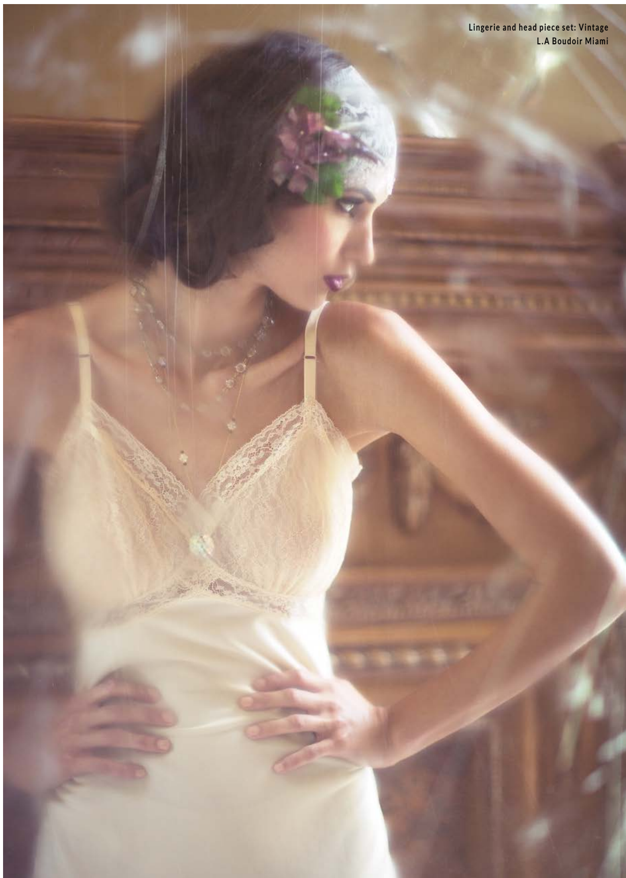
Lingerie and head piece set: Vintage L.A Boudoir Miami