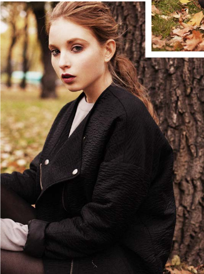
Dress: Cyrille Gassiline Coat: Monki Tights: Calzedonia Shoes: Topshop