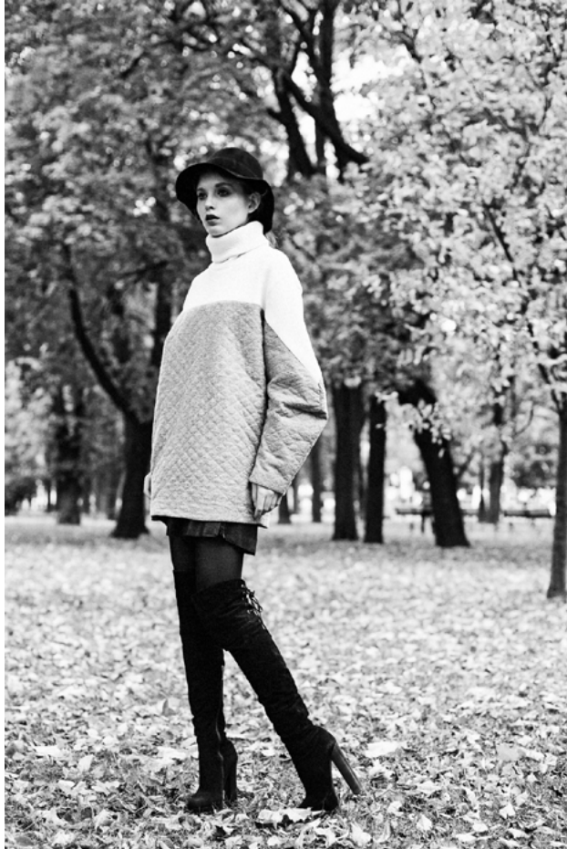
Sweater: One Meter Skirt: I Am Hat: Iyyk Tights: Calzedonia Shoes: Baldan