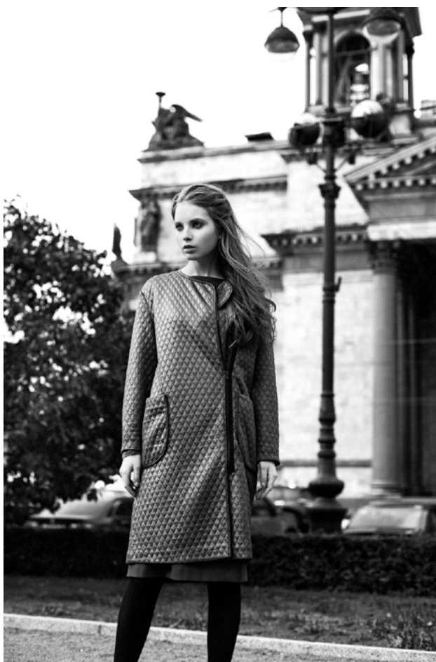
Dress: Cyrille Gassiline Coat: I Am Tights: Calzedonia Shoes: Baldan